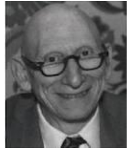
Alan Perlis First Department Chair

Led by a group of visionary enthusiasts, including Allen Newell, Herbert Simon, and Alan Perlis, the Department of Computer Science was formed in July 1965, with Alan Perlis as its head. As one of the first such departments in the nation, its creation was